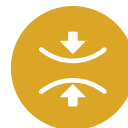
Short corridor available